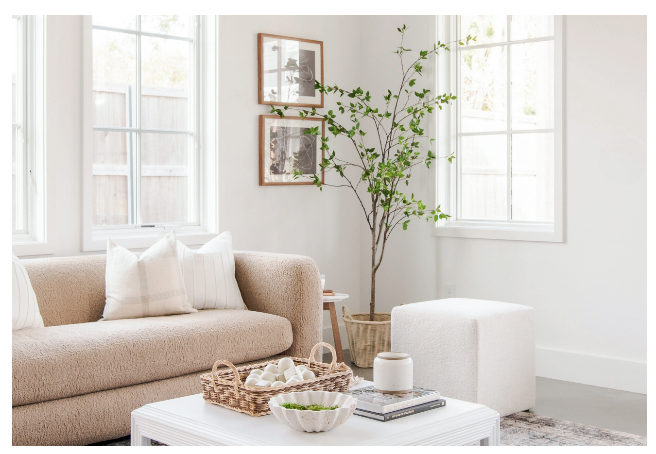
All marketing materials are provided for informational and inspiration purposes only. Prices and fees subject to change.

Encouraging community living, this Wheeler cottage faces a large shared courtyard, creating a blend of comfort and connectivity. The ground floor features a living room, kitchen, walk-in pantry, and powder bathroom. Upstairs, two bedrooms complete this cozy cottage, one having private access to a shared bathroom. Additionally, this home enjoys the benefit of an inviting front porch and a private backyard. Expect lower utility costs with top-of-the-line features including Pella windows, and geothermal heating and cooling.