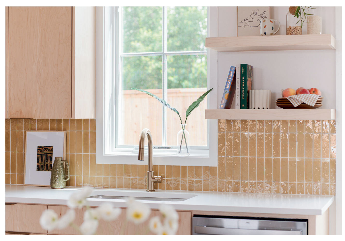
All marketing materials are provided for informational and inspiration purposes only. Prices and fees subject to change.

Encouraging community living, this Wheeler cottage faces a large shared courtyard, creating a blend of comfort and connectivity. The ground floor features a living room, kitchen, walk-in pantry, and powder bathroom. Upstairs, two bedrooms complete this cozy cottage, one having private access to a shared bathroom. Additionally, this home enjoys the benefit of an inviting front porch and a private backyard. Expect lower utility costs with top-of-the-line features including Pella windows, and geothermal heating and cooling.