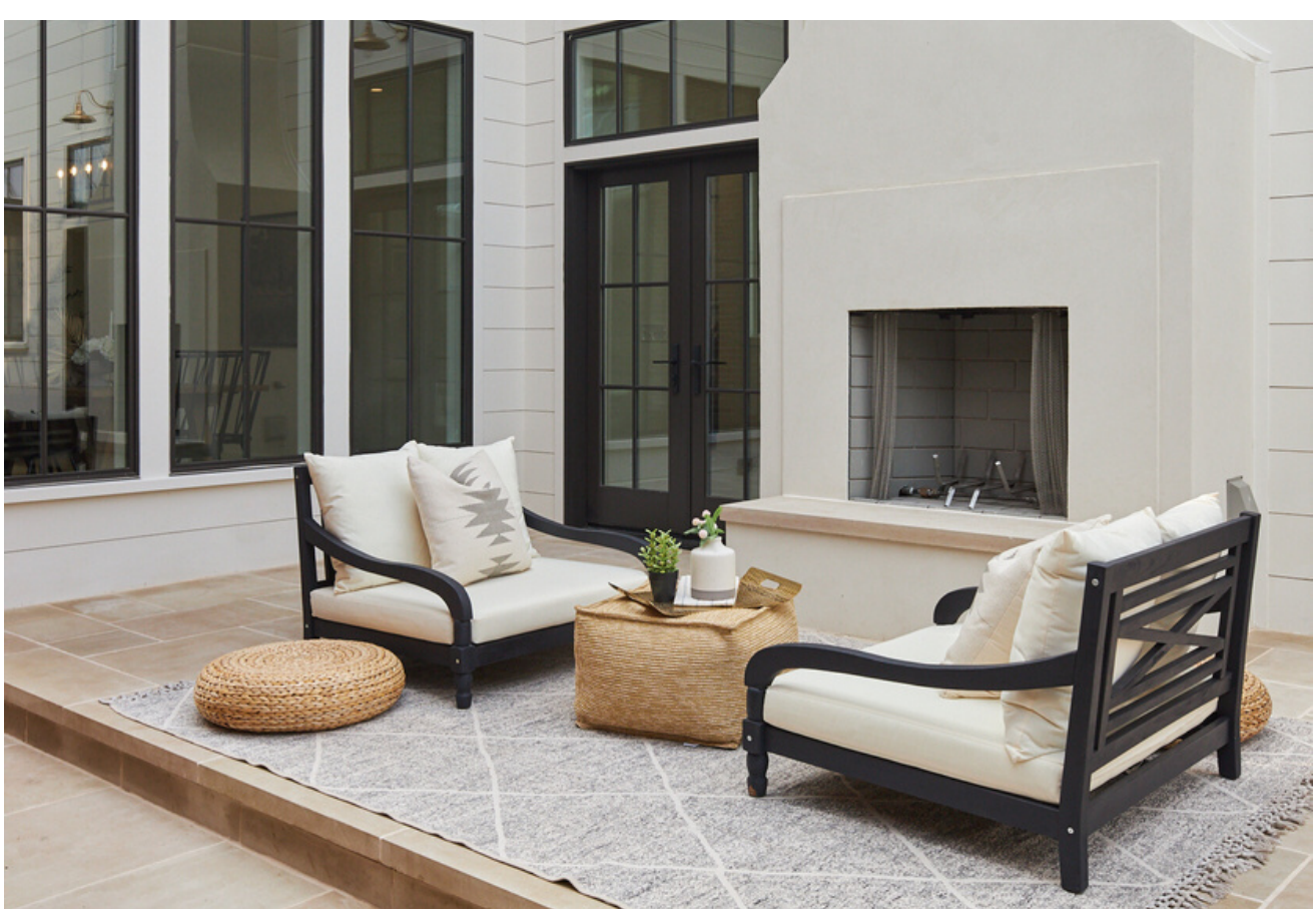
All marketing materials are provided for informational and inspiration purposes only. Prices and fees subject to change.

A corner lot gem in Wheeler, this two-story estate home checks off all of the must-haves of a family home with timeless finishes and a functional layout perfect for entertaining. The spacious entryway leads to a grand kitchen surrounded by windows and counter space galore. The living room opens onto a courtyard which is anchored by indoor and outdoor fireplaces. A vaulted primary suite, upstairs utility, large mudroom, pocket office and a flex-space make this house ideal for everyday living. This home is equipped with Pella windows, and geothermal heating and cooling for maximum efficiency and convenience.