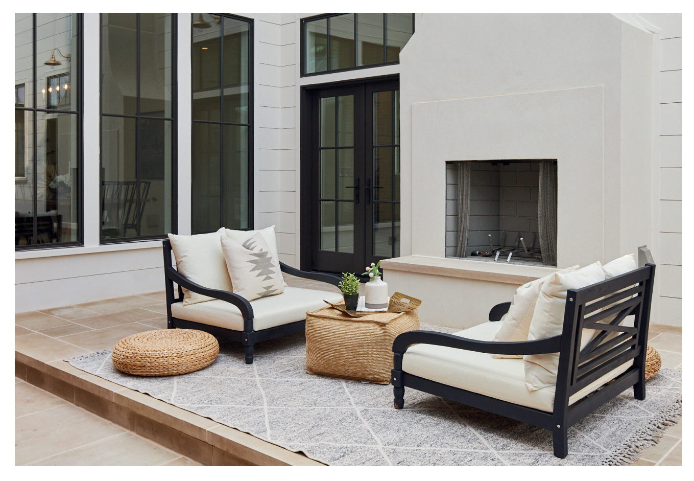
All marketing materials are provided for informational and inspiration purposes only. Prices and fees subject to change.

A corner lot gem in Wheeler, this two-story estate home checks off all of the must-haves of a family home with timeless finishes and a functional layout perfect for entertaining. The spacious entryway leads to a grand kitchen surrounded by windows and counter space galore. The living room opens onto a courtyard which is anchored by indoor and outdoor fireplaces. A vaulted primary suite, upstairs utility, large mudroom, pocket office and a flexspace make this house ideal for everyday living. This home is equipped with Pella windows, and geothermal heating and cooling for maximum efficiency and convenience.