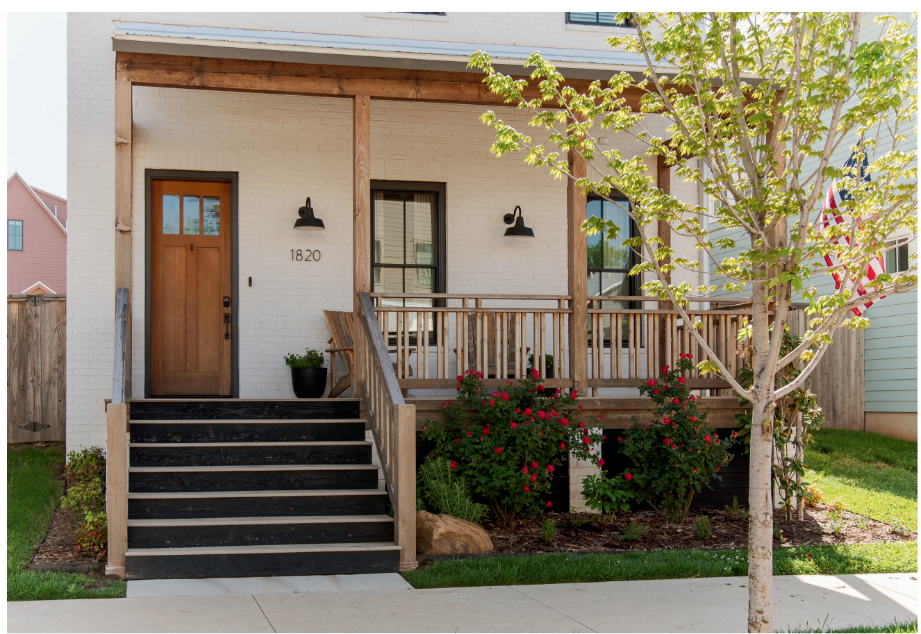
All marketing materials are provided for informational and inspiration purposes only. Prices and fees subject to change.

This beautifully maintained and thoughtfully upgraded home blends timeless design with modern efficiency. The open-concept layout features a spacious living area, seamlessly connected kitchen and dining spaces, and sliding glass doors that open to a covered patio —perfect for effortless indoor/outdoor living. A versatile flex space offers endless possibilities to suit your lifestyle. With premium Pella windows, geothermal heating and cooling, and solar panels, energy efficiency is built into every detail. A two-car garage with built-in storage adds everyday convenience. To top it off, the park and pool are just steps from your front door!